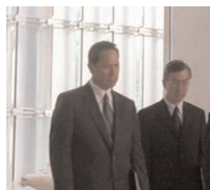
Without Backlight Compensation

adjusts to it, resulting in a darker image. To avoid this, a mechanism called backlight compensation is introduced. It strives to ignore small areas of high illumination, just as if they were not present at all. With backlight compensation, the image from the example above would have the same exposure regardless of whether the flashlight was present or not. The resulting image enables the person to be visually seen and identified. Without backlight compensation, the image would be too dark, and identification would be impossible.