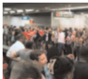
Without Edge Enhancement

Image edge enhancement is utilised to strengthen the signal level on the edges and corners of the image, producing clearer, more distinct pictures.