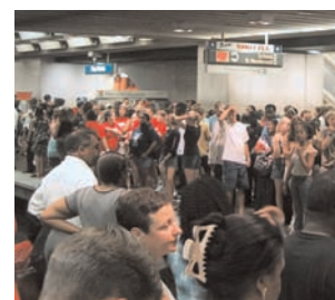
With Edge Enhancement